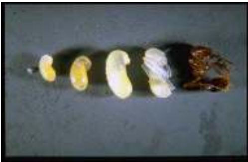
Egg, larval stages, pupa and adult fire ant worker.

and soybean oil. Before broadcasting the fire ant bait, foraging activity should be assessed. In order to test for foraging activity, place a potato chip or