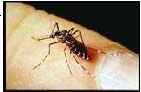
Asian tiger mosquito, Aedes albopictus (Skuse) (Diptera: Culicidae).