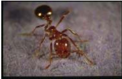
Red imported fire ant worker.

Since the recent rains, there have been more visible fire ant mounds in area landscapes. Fire ant mounds are not only unsightly, but these ants are medically important. They are aggressive and tend to come out of their colony by the thousands when disturbed. This causes us to have no choice, but to use control methods for these ants!